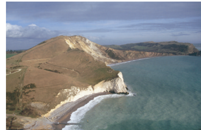
Arish Mell and Worbarrow Bay.