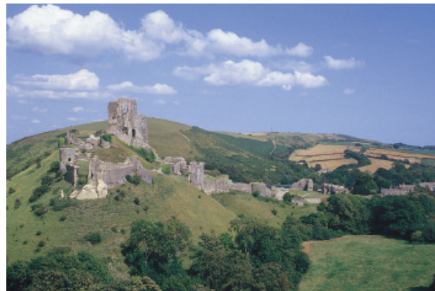
Corfe Castle, East Hill and Challow Hill.