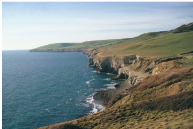
The south coast of Purbeck near Dancing Ledge.